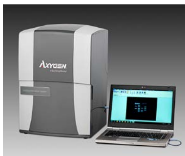
Axygen Gel Documentation System

Axygen Gel Documentation systems easily capture publication quality, 16 bit TIFF images. The systems are quick to set up and have an intuitive user interface for image capture, annotation, and contrast adjustment. Images are easily saved and opened in common gel analysis software for more detailed analysis.