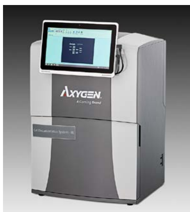
Axygen Gel Documentation System-BL